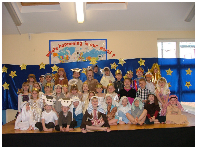
Foundation Stage, Year 1 and 2 children celebrate Christmas by performing their Nativity, 'It's a baby!' for parents and family.

The caring ethos and often outstanding standard of teaching has clearly impressed the Ofsted inspectors and certainly, only a good school could boast contented school children, parents and teachers.