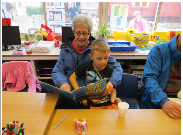
The school's recent Pyjama Day was in aid of the purchase of new laptops but the traditional art of reading with children and grandchildren was celebrated.