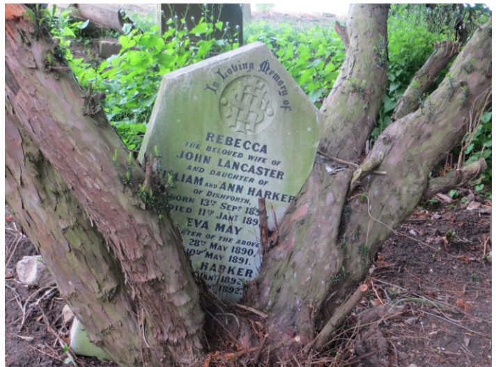
A lady died, was buried and came back to earth as a tree.