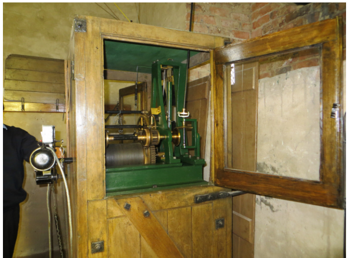
The tower clock made by the famous firm of T Cooke of York and installed in 1858. It is No 4 and is the earliest turret clock by this maker that survives; numbers 1-3 no longer exist for various reasons! No 3 for instance was installed at St Martin le Grand, Coney St, York but was destroyed by a bomb during World War 1!