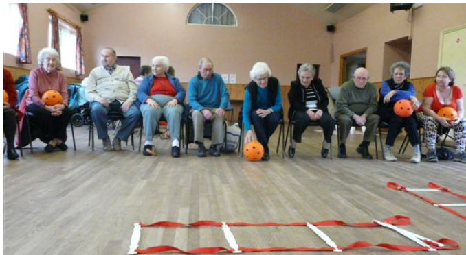
Inter-club match against Husthwaite Boccia Club

Meanwhile, the other Tuesdays are taken up with Boccia which takes place from 1.30-3.30 in the village hall. Sixteen regulars play varied games, and thoroughly enjoy the leisurely exercise while socialising and improving their skills and co-ordination. These are games in which people of all ages, abilities and levels of co-ordination can take part, and a lot of often boisterous fun is had by all.