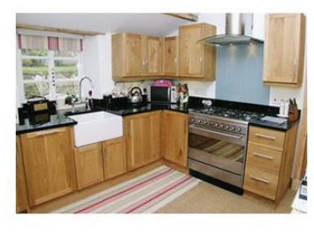
Kitchens Bedroon Bathrooms Conserva