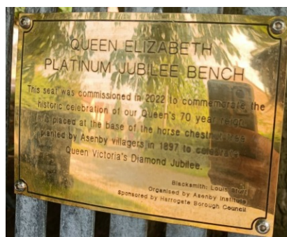
The Asenby Plaque