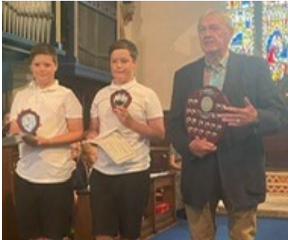
Twins get award

They were chosen by school staff to be presented with the award in recognition of the way in which they have always been extremely helpful and have always tried throughout their time at the school.