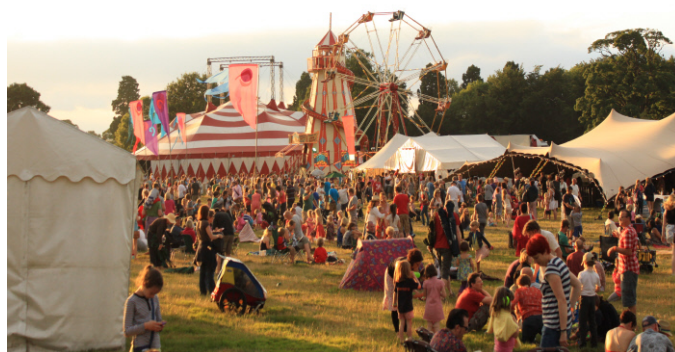
A sunlit lively crowd

The Deer Shed seems to have been a fantastic success; certainly everyone who attended was full of praise for the organisation, performers, activities and friendly happy atmosphere.