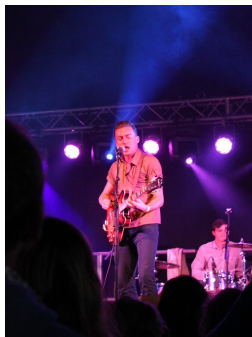
One of the star performers Willy Mason

"From our point of view the event was really successful and the weather was fantastic. So nice to set up the festival and not be sobbing at the amount of water lapping around your boots. The site was reshuffled this year and consequently the main stage is no longer pointing at Topcliffe which undoubtedly resulted in lower noise levels for residents over the weekend."