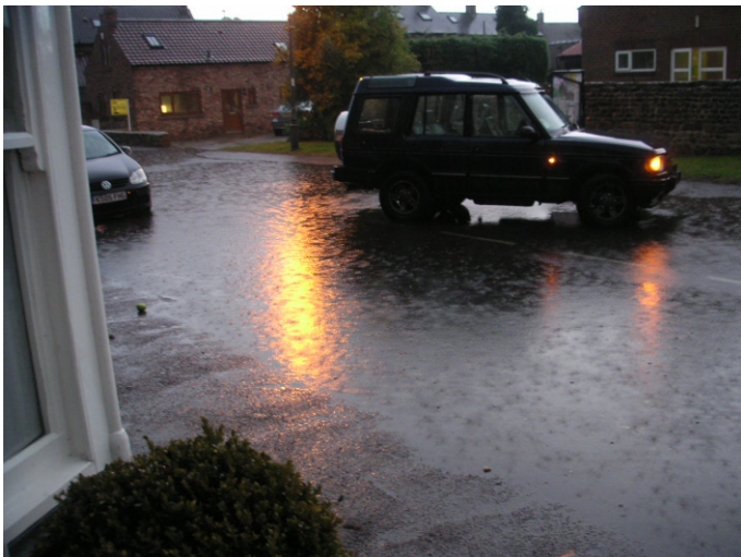
Front Street Succumbs to Floods Yet again.

Perhaps you would like to support this fundraising event with a contribution for the raffle or an item for the cake stall? - all contributions would be gratefully received. If you can help in this way, please give Brenda Pilgrim a call on 01845 578669.