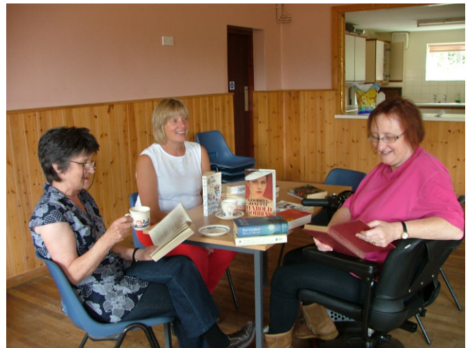
Three familiar bookworms pretending to read Jane Austen although they obviously all have their eye on the Harold Robbins on the table.

Best of all, there are no steely-eyed librarians giving you evil glares if your books are a week overdue, nor would anyone raise a questioning eyebrow if you borrowed a saucy book, of which there are just a few, well, perhaps one or two. And I think someone's already borrowed them. You might have to get your name down.