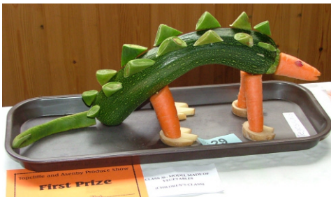
Dave Bowman was the overall winner and Graham Marsden was given special mention for his six First

The village hall was transformed recently by a colourful display of fruit, vegetables and art-work, whilst everyone was full of admiration for the vivid and fragrant flower arrangements. Home-made cakes and jars of jam and lemon curd looked delicious whilst the "strangely shaped" vegetables were, of course, predictably saucy. Red onions had been polished to perfection and even the earthy beetroot had been subjected to some energetic scrubbing. Displays were spotless, orderly and artfully arranged. Paintings and cross-stitch samples revealed some impressive artistic talents while the children's competitions confirmed that creativity flourishes at Topcliffe School.