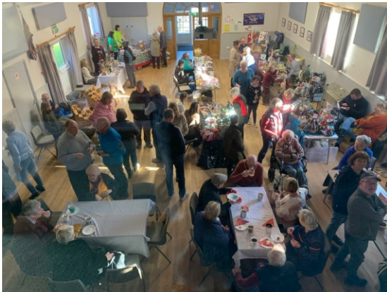
A good crowd enjoying the fair

The Christmas season got off to a fine start with the excellent Christmas Fair held last month in Topcliffe & Asenby Village Hall. Lots of people visited the many stalls and enjoyed a pork and stuffing sandwich, cakes and a cuppa.