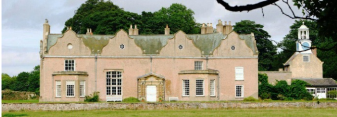
Norton Conyers Hall

The house was first mentioned in the Domesday Book in 1086 but recent discoveries suggest there was a habitation in Viking times. It is one of the most complex timber-framed houses in the country and except for the twenty years between 1862 and 1882, has been in the Graham family since 1624.