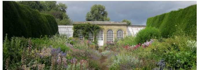
Norton Conyers Hall gardens

The gardens were laid out in the mid-18th century and they retain the essentials of their original design, together with sympathetic replanting in the English style. The large and magical walled garden has a central Orangery, an ornamental pond, magnificent herbaceous borders and parkland beyond.