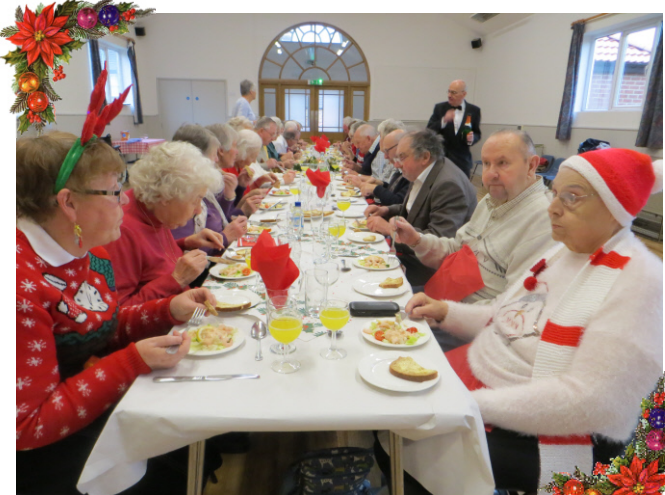
As you can see, everyone certainly tucked in last year.

The very popular Christmas Lunch will be served on December 19 in the village hall. Ring Judith on 577911 for more information. For £15 a fantastic meal which includes turkey and all the trimmings will be served. The lunch is for the over-65s and places are limited.