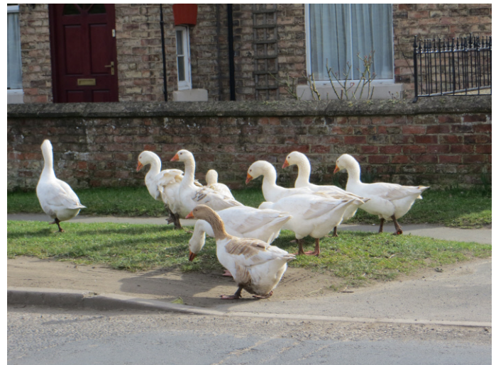
The famous celebrities of Topcliffe, Anne-Marie's geese, stagger home from the pub and hope that there'll be a nice supper waiting for them