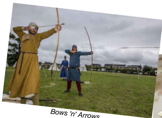
Bows 'n' Arrows