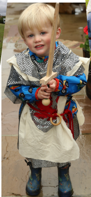
Big Sword, Little Boy