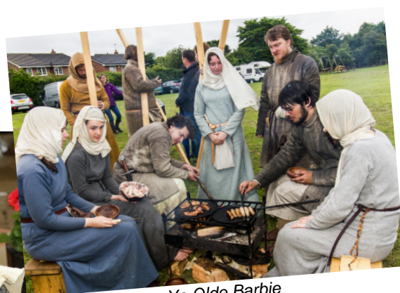
Ye Olde Barbie