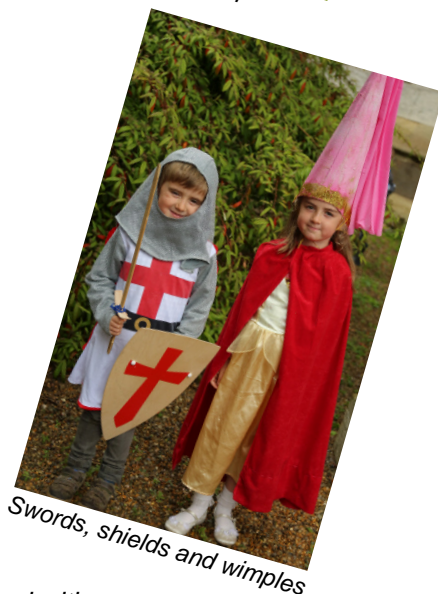
Swords, shields and wimples